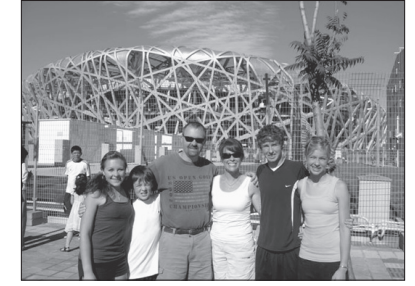
Stopping for a family photo in front of the Olympic "Bird's Nest."

streets—selling everything from turtles to scorpions. The first few weeks we tried the markets. It sounded fun, but realizing that we couldn't bargain in Chinese, and watching a little boy urinate right next to a fruit stand, changed our minds in a hurry. There was a Super Wal-Mart about 6 blocks from our apartment. We tried that a couple of times, but it felt like being in the frenzy of Christmas shopping every time we went. Hundreds of young Chinese girls with cordless microphones were trying to sell something, and the noise was overwhelming.